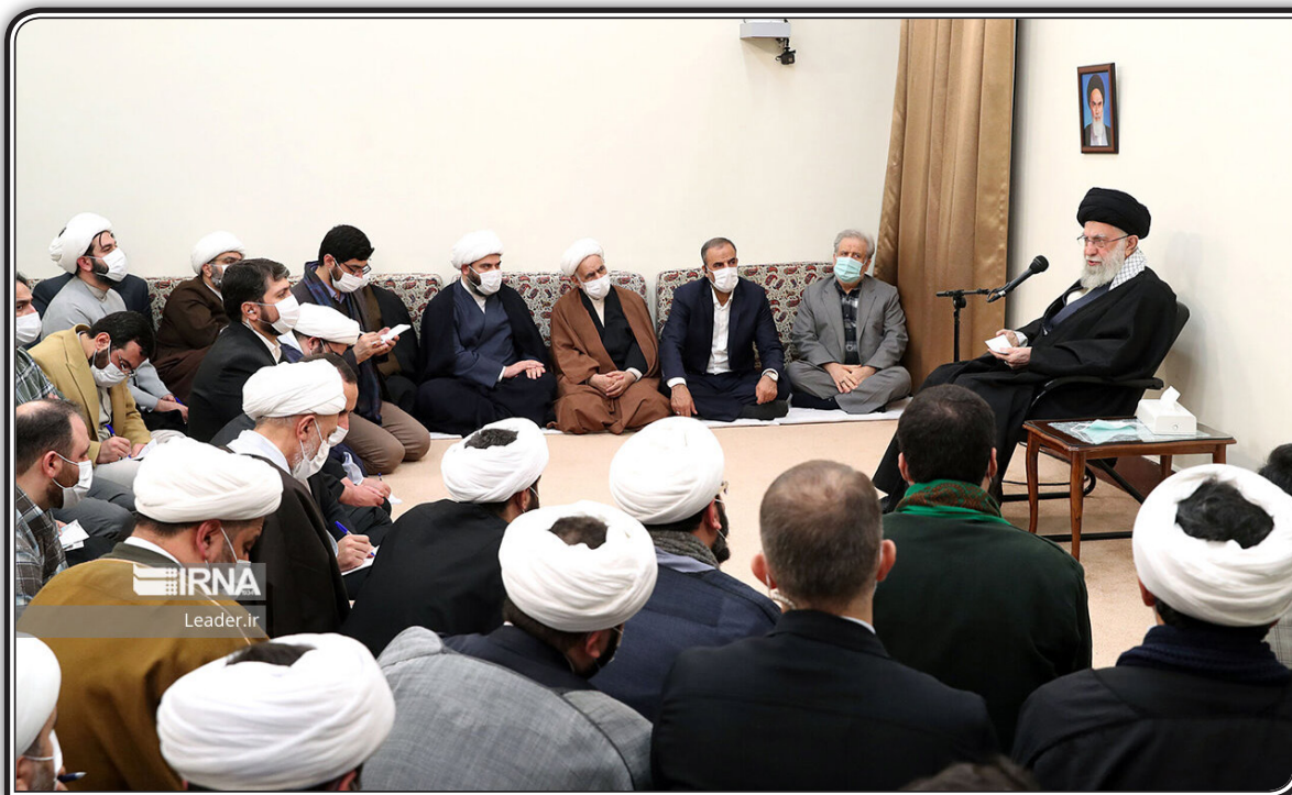
Ayatollah Khamenei meets with officials of the Islamic Propagation Organization in Tehran on Wednesday.

TEHRAN -- Leader of the Islamic Revolution Ayatollah Seyyed Ali Khamenei on Wednesday described plans to develop cultural products based on new ideas and awareness of the socio-cultural requirements as an important duty of cultural organizations in Iran.