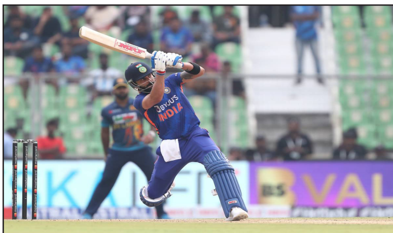
India creates new record by beating Sri Lanka with biggest margin in ODI cricket.

The 34-year-old, who moved to within three centuries of equal-