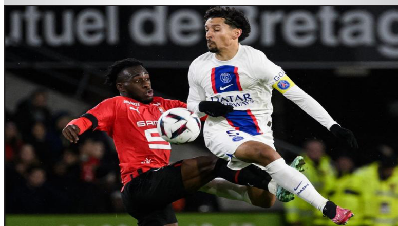
Paris Saint-Germain's Brazilian defender Marquinhos fights for the ball with Rennes' French forward Arnaud Kalimuendo during the French L1 football match between Stade Rennais FC and Paris Saint-Germain (PSG) at the Roazhon Park stadium in Rennes, western France, on Jan 15, 2023.

PARIS (Reuters) - Paris St Germain suffered their second defeat of the season in a 1-0 loss to Stade Rennais on Sunday as their Ligue 1 lead was slashed to three points.