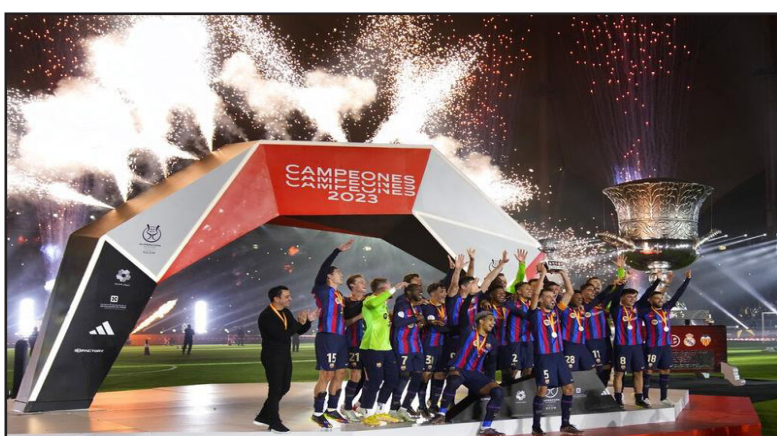
Barcelona players celebrate with a trophy after they won the final of the Spanish Super Cup between Barcelona and Real Madrid, in Riyadh, Saudi Arabia on Jan 15, 2023.

33rd minute after Real defender Antonio Ruediger gave the ball away to Barca's Sergio Busquets, who began a move that ended with Gavi all alone inside the box to score with a precise left-foot strike.