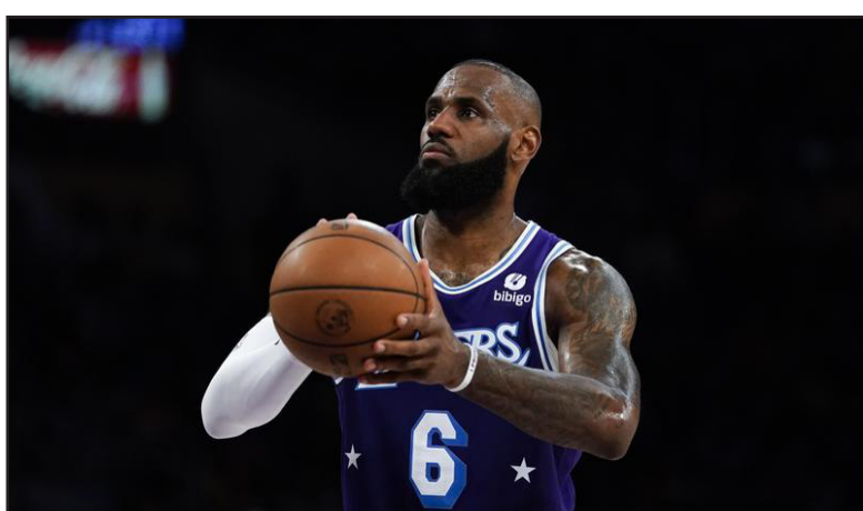
Los Angeles Lakers forward LeBron James shoots during an NBA basketball game against the New Orleans Pelicans in Los Angeles on April 1, 2022.

A four-times champion and four-times MVP, James is on course to break former Lakers center Ab-