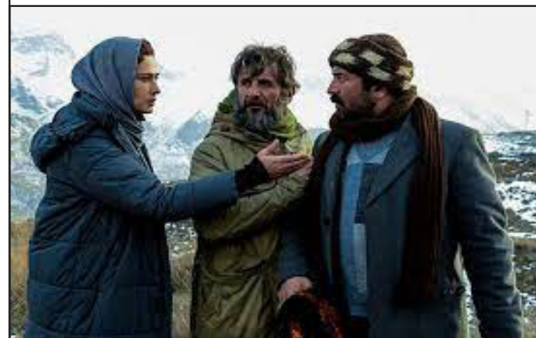
A still from Iranian feature film 'The Last snow'.

TEHRAN (IFILM) -- Iranian feature film 'The Last snow' has been on screen at