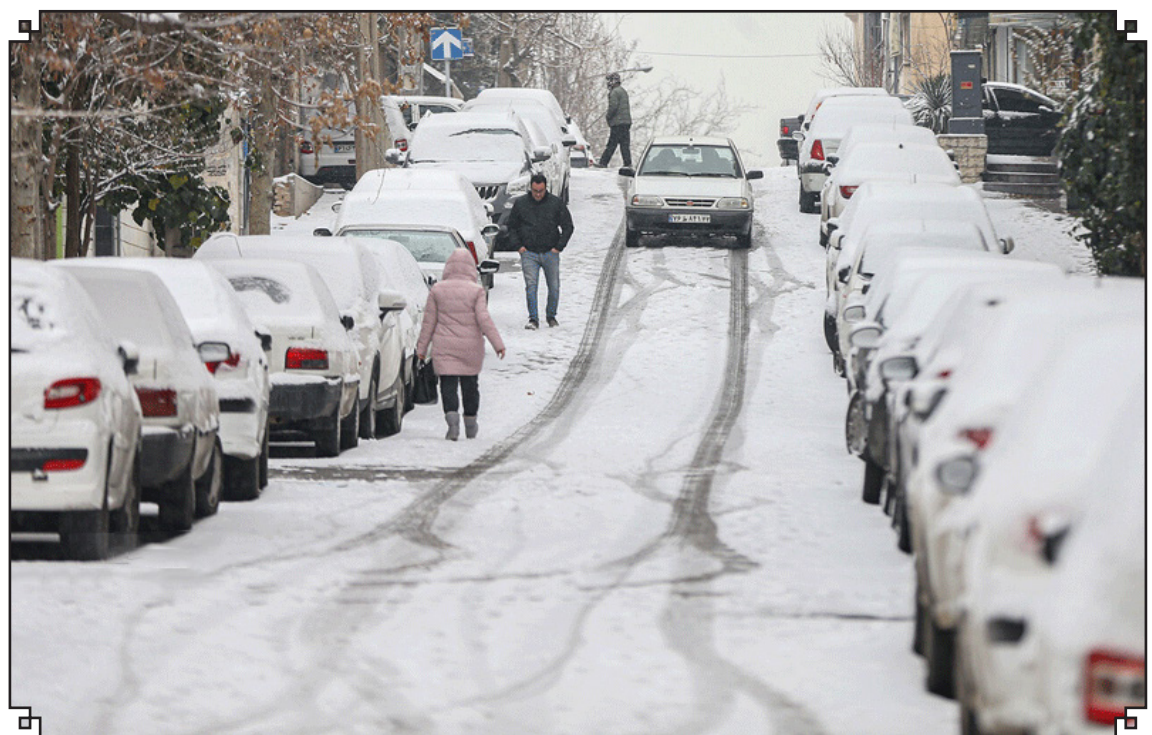
On the 25th day of winter, snow covered the city of Tehran.