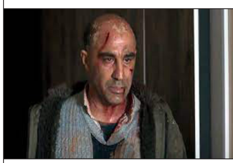
A scene from Iranian feature film 'World War III'.

TEHRAN (IFILM) -- Acclaimed Iranian feature film 'World War III' has been competing at the 4th Hainan Island International Film Festival (HIIFF) in China.