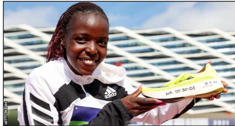
Kenya's Agnes Tirop broke the world record for a women's 10km road race in Germany in September

Last month, Tirop set the world record for a women's only 10km road race in Germany.