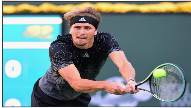
Alexander Zverev of Germany hits a backhand return against Andy Murray of Great Britain during their Round 3 match at ATP-WTA Indian Wells tennis tournament on Oct 12, 2021 in Indian Wells, California.

CALIFORNIA (Reuters) - Alexander Zverev notched his first career win against Andy Murray on Tuesday with a 6-4 7-6(4) victory that moved him into the fourth round at Indian Wells.