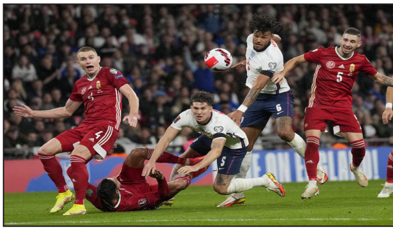
England's John Stones, centre, falls as he attempts a shot on goal during the World Cup 2022 group I qualifying soccer match between England and Hungary at Wembley stadium in London, Oct 12, 2021.

Hungary were certainly more energetic and looked more mo-