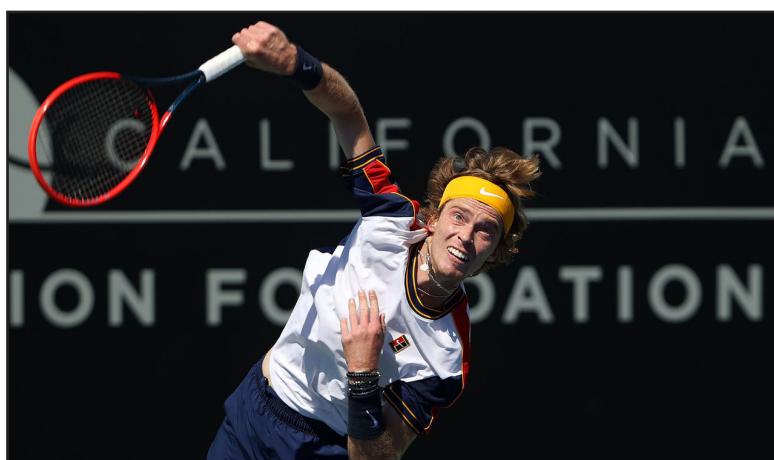
Russia's Andrey Rublev

“This is my first semifinal on hard court after reaching the quar-