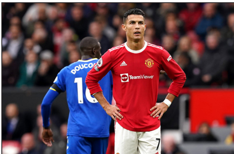
Manchester United's Cristiano Ronaldo looks on during the game

A point is enough to move both sides level on points with league leaders Liverpool, who face champions Manchester City on Sunday.