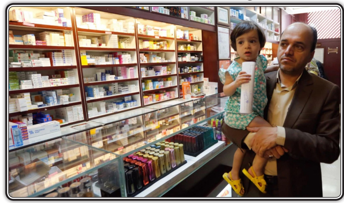
An Iranian man shops at a drugstore at the Nikan hospital in Tehran on September 11, 2018.

NEW YORK (Dispatches) -- The Permanent Mission of the Islamic Republic to the United Nations has censured the U.S. for imposing inhumane restrictive measures against Iran especially during the COVID-19 pandemic, saying the illegal sanctions deprived the country of its right to have access to vaccines at the appropriate time.