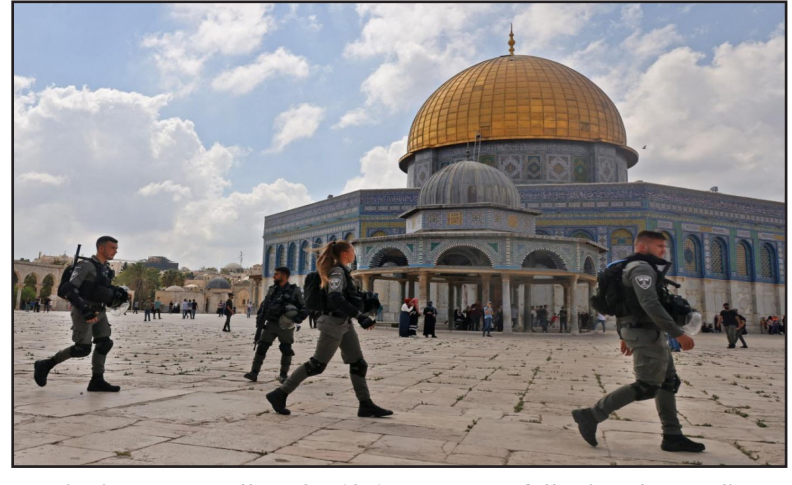
Zionist troops walk at the Al-Aqsa mosque following the Muslim Friday noon prayers in the complex.

AL-QUDS (Dispatches) – Over 500 Zionist settlers, accompanied by troops and members of Knesset, broke into Al-Aqsa compound in Al-Quds during the holiday of Sukkot on Wednesday, the Palestinian News Agency (Wafa) reported.