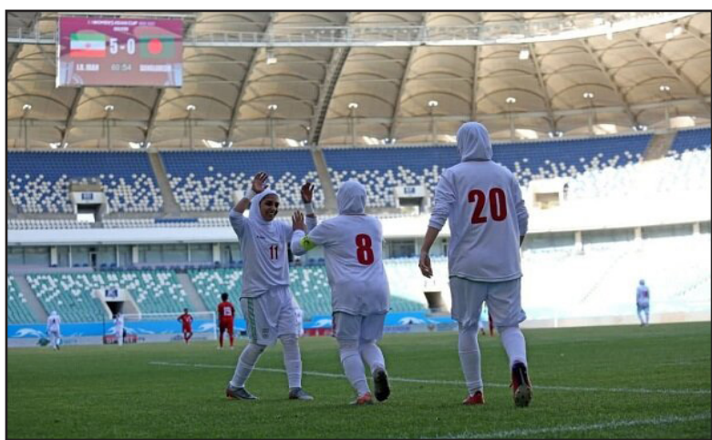
TEHRAN — Iran National Women's Football team thrashed Bangladesh 5-0 on Wednesday in Group G match of the 2022 AFC Women's Asian Cup qualification.

The 2022 AFC Women's Asian Cup qualification is hosted by Uzbekistan, Tashkent.