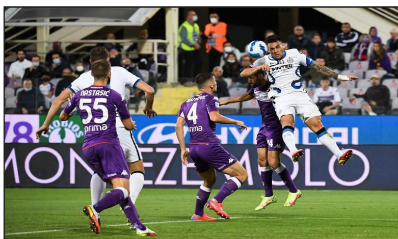
Inter Milan's Argentine forward Lautaro Martinez (right) and Fiorentina's Italian midfielder Marco Benassi (second right)

FLORENCE, Italy (Reuters) — Inter Milan moved provisionally top of Serie A as goals by Edin Dzeko and Ivan Perisic helped the Italian champions secure a 3-1 comeback victory at Fiorentina on Tuesday.