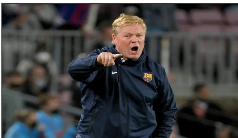
Ronald Koeman played for Barcelona between 1989-1995

"The financial situation of the club is connected to the