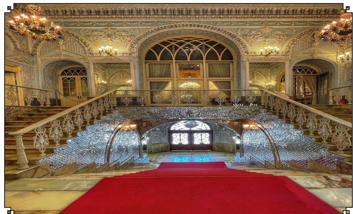
Salam Hall is one of the halls of Golestan Museum Palace, which was built during the era of Nasser al-Din Shah Qajar in three years and is currently used as a museum. It is known as the largest hall of Golestan Palace Complex.