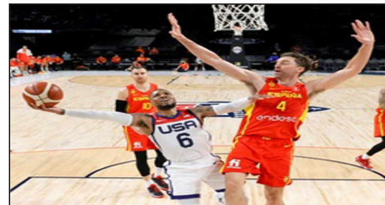
U.S. Damian Lillard, left, shoots against Spain's Pau Gasol during a pre-Olympic exhibition game in Las Vegas

LAS VEGAS (Dispatches) - U.S. got back on track as they came from behind to beat reigning world champion Spain 83-76, in their final exhibition game before heading to Tokyo for the Olympic men's basketball tournament.