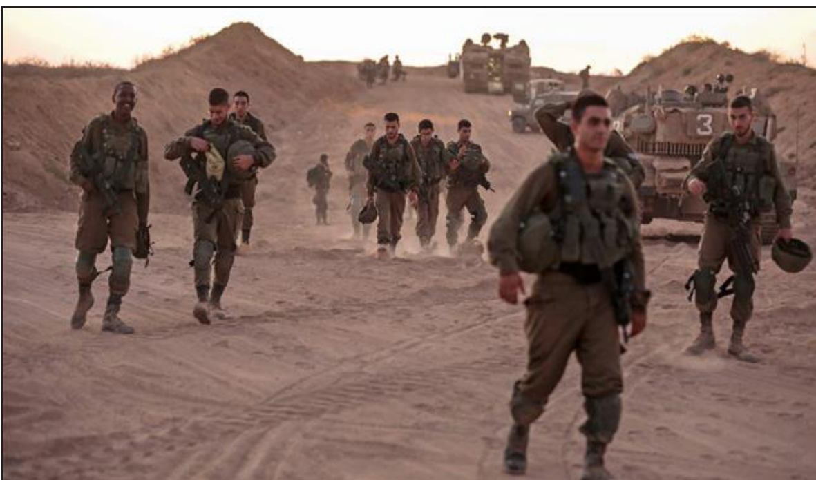
Zionist infantry troopers walk next to tanks and armored personnel carriers near the Gaza Strip, on August 16, 2020.

WEST BANK (Dispatches) – The Zionist regime's army chief Aviv Kochavi said on Wednesday that the espionage officer who died in military prison was about to compromise "a big secret," and that he was stopped "at the last minute."