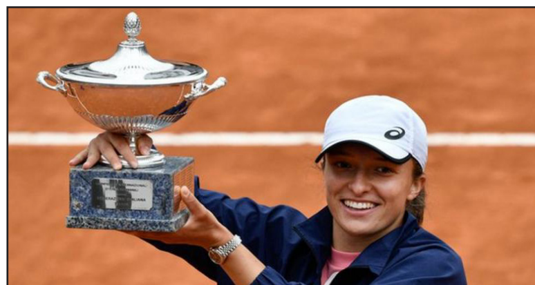
Swiatek claimed her third WTA title having followed her Roland Garros success with a win in Adelaide in January

"I will just quickly forget about today," said Pliskova, who was playing in her third consecutive Rome final.