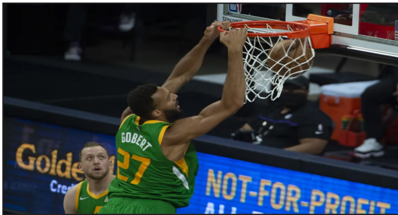
Utah Jazz center Rudy Gobert (27) dunks the ball against the Sacramento Kings during the first quarter of an NBA basketball game in Sacramento, Calif., Sunday, May 16, 2021.

Now comes the waiting game for coach Quin Snyder's team. Utah awaits one of the surviving teams from the play-in