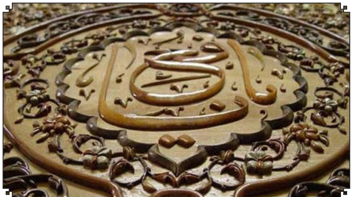
Nazok-Kari, which is making delicate objects, both applicable and artistic, from wood, is one of the ancient Persian crafts practiced in the Iranian city of Urmia for centuries.