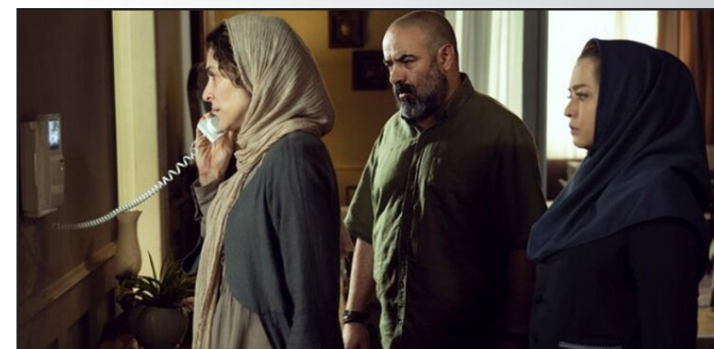
A still from the Iranian film "The Badger".

"Wooden Sword" tells the story of two young boys who meet on a park bench while waiting for their