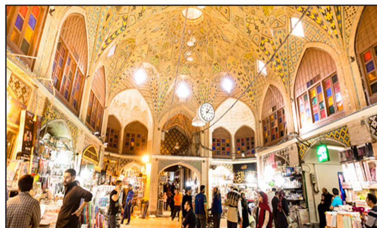
Nowruz, including clothing and trail mix.

With the arrival of spring and Nowruz's ancient occasion, People in Tabriz go to the Grand Bazaar to purchase what they need to celebrate