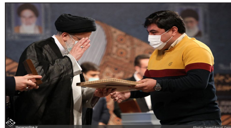
The awards ceremony of the 26 winners of the 39th Book of the Year Awards of the Islamic Republic and the 4 winners of the 29th World Book Awards of the Islamic Republic was held with President Raisi taking part.

The Book of the Year Award of the Islamic Republic was held in philosophy and psychology, religion, jurisprudence and principles, pure sciences, applied sciences, literature, classical poetry, ancient texts, history, and geography, documentary, and children and adolescents.