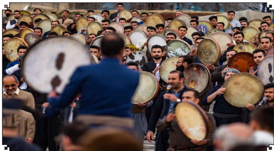
The Iranian capital Tehran has held a ceremony featuring traditional music and arts to celebrate Nowruz, a festival that marks the Persian New Year. The ceremony, which was held on Monday, was organized in collaboration with Iranian National Commission for UNESCO. Iranians and millions of people around the world celebrate Nowruz which marks the beginning of spring. Traditionally in Iran, people decorate a Nowruz table, visit friends and relatives, and give presents during the first days of the New Year.