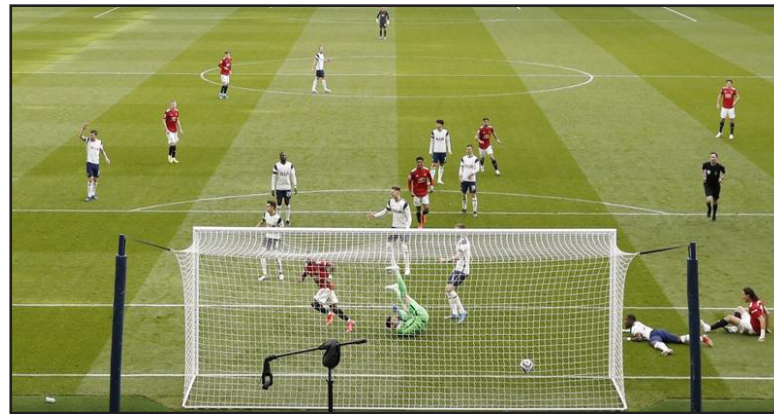
Manchester United's Brazilian midfielder Fred scores a goal during the English Premier League football match between Tottenham Hotspur and Manchester United at Tottenham Hotspur Stadium in London, on April 11, 2021.

United had an opener scored by Cavani controversially disallowed after Scott McTominay was harshly adjudged to have fouled Son in the build-up -- accidentally catching the South Korean in the face with a trailing hand.