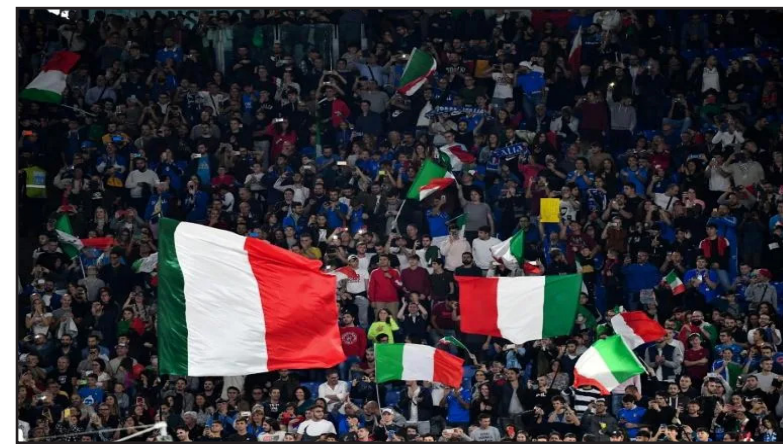
The Italian government has yet to decide how many fans will be allowed into the Stadio Olimpico where their country plays its three group games

ROME (AFP) – Italy needs more time from UEFA to decide how many fans can safely attend Euro 2020 matches in Rome, the Italian government's chief scientific advisor said on Monday.