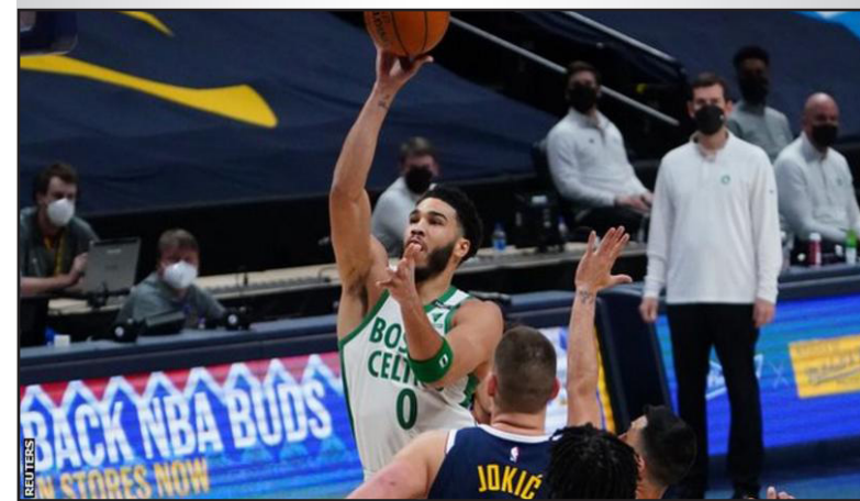
Tatum was key in helping Boston Celtics to victory

WASHINGTON (Dispatches) – The Boston Celtics ended the Denver Nuggets' eight-game winning streak with a 105-87 win in the NBA.