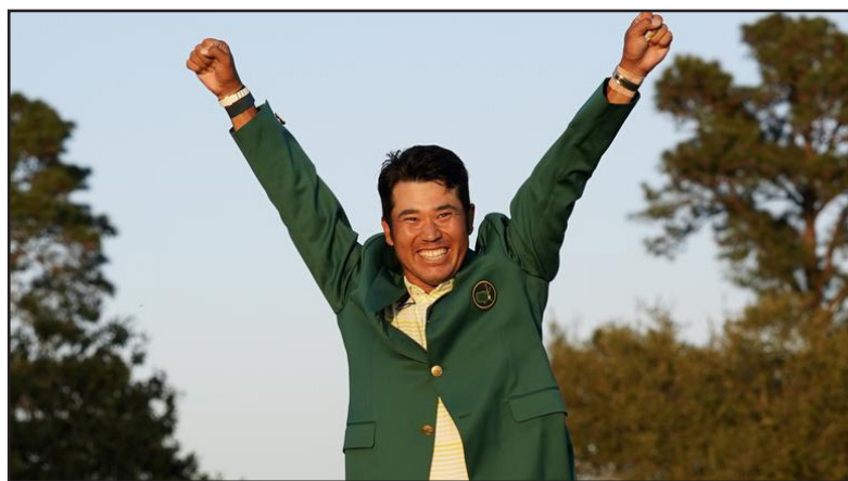
Hideki Matsuyama, of Japan, celebrates after putting on the champion's green jacket after winning the Masters golf tournament on Sunday, April 11, 2021, in Augusta.

LONDON (Dispatches) – Hideki Matsuyama held off the field to win the Masters by one stroke at Augusta National and become the first Japanese man to claim a major title.