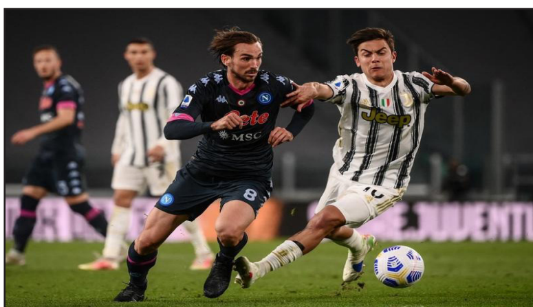
Juventus' Argentine forward Paulo Dybala, right, challenges Napoli's Spanish midfielder Fabian Ruiz during the Italian Serie A football match Juventus vs Napoli on April 7, 2021 at the Juventus stadium in Turin.

The game between Juventus and Napoli was set to kick off