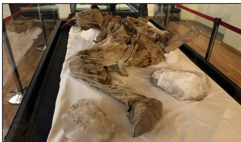
The exhibition hosted by the German Mining Museum in Bochum is titled "Death in Salt, an Archaeological Narrative of the Land of Persia".

TEHRAN (IFILM) -- Iran and Germany have teamed up holding two separate loan exhibitions featuring ancient mining and relevant documents of the two countries. The exhibition hosted by the German Mining Museum in Bochum is titled "Death in Salt, an Archaeological Narrative of the Land of Persia" and the other organized by National Museum of Iran is named "Human Search for Resources."