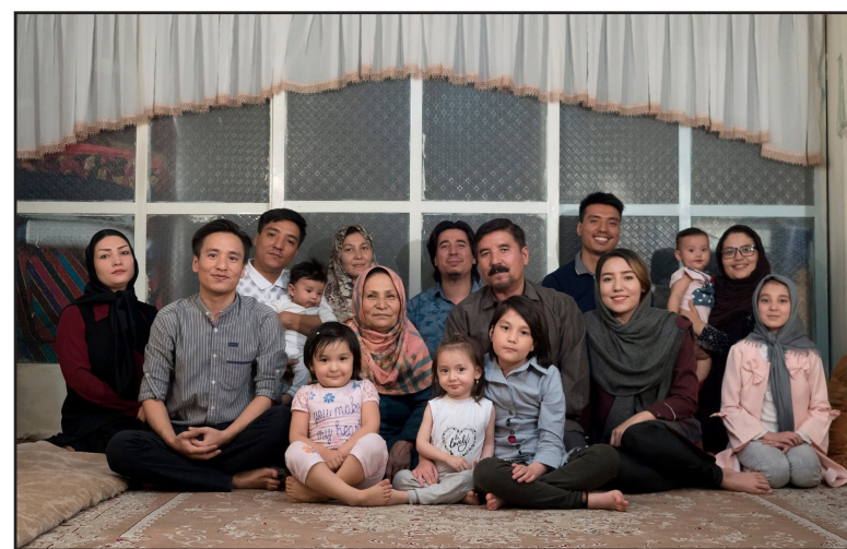
A still from Iranian documentary 'The Silhouettes'.

of the family wants to move back to Afghanistan to live and work there, but his family does not allow him.