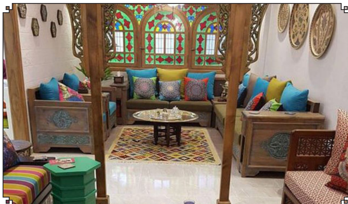
Persian handicrafts in the interior design of houses create a sense of aesthetics. Iran ranks first globally for the number of cities and villages registered by the World Crafts Council, as China with seven entries, Chile with four, and India with three ones come next.