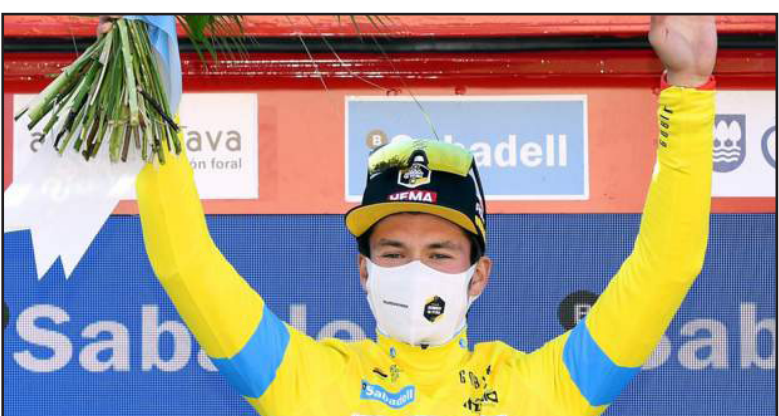
Pogacar's team-mate Brandon McNulty was second, two seconds behind Roglic.

Last year's Tour de France winner Tadej Pogacar of UAE-Team Emirates was also 28 seconds down in fifth.