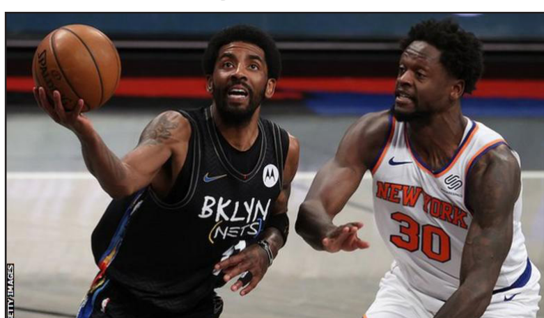
Kyrie Irving's three-pointer in the final minute secured victory for the Brooklyn Nets

NEW YORK (Dispatches) - Kyrie Irving scored 40 points including a final-minute three-pointer to help the Brooklyn Nets fight back to beat the New York Knicks 114-112.