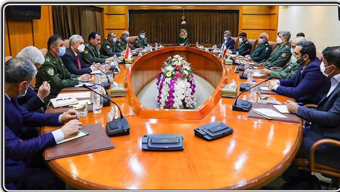
Iranian Minister of Defense Brigadier General Amir Hatami (4th R) and his Tajik counterpart Colonel General Sherali Mirzo (5th L) meet in Tehran on April 6, 2021.

TEHRAN (Dispatches) - Iranian Minister of Defense Brigadier General Amir Hatami has hailed deep-rooted, cordial relations with his Tajik counterpart, Colonel General Sherali Mirzo, on Tuesday, saying the two countries are moving towards the further expansion of cooperation in the defense and military sectors on the basis of mutual respect and confidence.