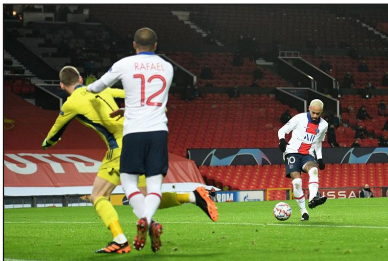
Paris Saint-Germain's Brazilian forward Neymar (right) scores his team's third goal during the UEFA Champions League group H football match between Manchester United and Paris Saint Germain at Old Trafford in Manchester, north west England, on Dec 2, 2020.

Cavani was sent through and launched an audacious chip over the advancing Navas but the ball