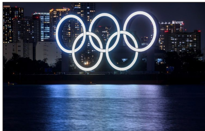
The Tokyo Olympics were delayed for a year

TOKYO (AFP) – The coronavirus-delayed Tokyo Olympics will cost at least an extra $2.4 billion, organizers said Friday, with the unprecedented postponement and a raft of pandemic health measures ballooning an already outsized budget. Tokyo 2020 said an additional $1.5 billion would be needed for operational costs related to the delay, with another $900 million in spending on coronavirus countermeasures for the Games next year.