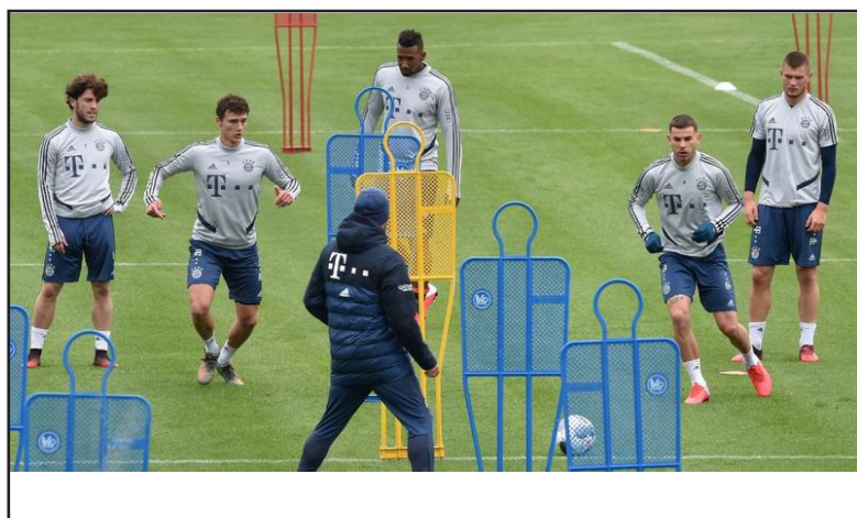
Bayern Munich's players practice during a training session with headcoach Hansi Flick at the football team's training grounds in Munich, southern Germany, on May 5, 2020.

BERLIN (Reuters) - Germany's Bundesliga is set to be given the green light for a restart, probably from May 15, as part of measures to further ease the country's coronavirus regulations, two people familiar with the preparations told Reuters. The Bundesliga would be the first of the five major European domestic soccer leagues to resume play after a stoppage which has seen almost all football put on