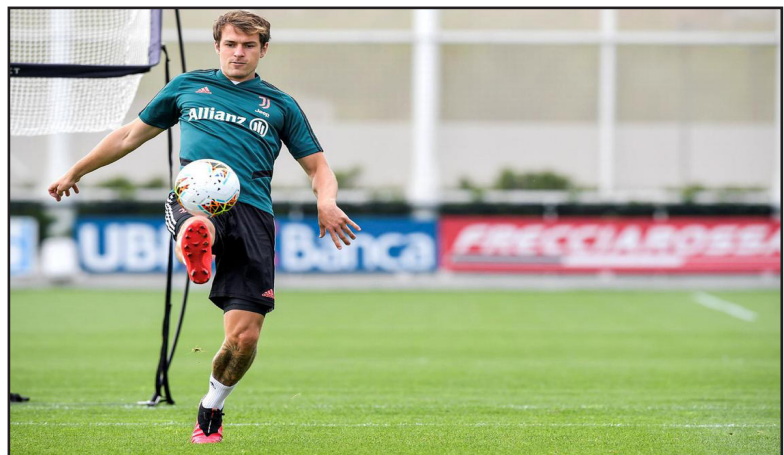
Aaron Ramsey resumes training for Juventus.

centre, while Cristiano Ronaldo began two weeks' coronavirus quarantine after returning to Italy. Captain Chiellini, 35, arrived early with Italy defender Leonardo Bonucci, just after midfielder Aaron Ramsey. Playmaker Miralem Pjanic showed up in the afternoon, along with Juan Cuadrado, Mattia De Sciglio, Federico Bernardeschi and Daniele Rugani. Serie A champions Juve said the training sessions, which are allowed thanks to Sunday's green light from the Italian interior ministry, "will take place