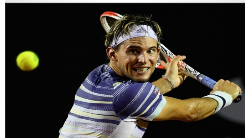
Austria's Dominic Thiem is sceptical about a relief fund for struggling tennis players

PARIS (AFP) - A fund for tennis players hardest hit by the coronavirus pandemic has been created, the sport's governing bodies announced, adding that they had contributed more than $6 million (5.3 million euros). In a joint statement, the ATP and WTA tours, the International Tennis Federation and the four Grand Slam tournaments -- the Australian Open, Roland-Garros, Wimbledon and the U.S. Open -- said the Player Relief Program will support those "who are facing unprecedented challenges due to the global impact of COVID-19". With the tennis season suspended until at least July 13, some "800 ATP/WTA singles and doubles players" are in need of financial support, the statement continued, with eligibility for the fund determined by a player's ranking and previous prize money earnings.