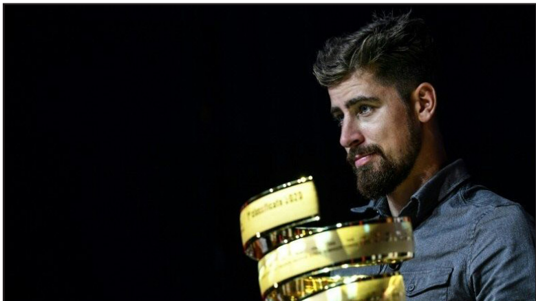
Ex-world champion Peter Sagan had been expected to compete for the first time in the 2020 Giro d'Italia

MILAN (AFP) - Italy's Giro d'Italia was branded "the biggest loser" on Wednesday amid anger over the revised international cycling calendar which Italians believe favors the Tour de France. "Rosa Di Rabbia (Pink with anger)," daily Gazzetta Dello Sport wrote on the front page of "a decision that goes against common sense and history". "Lots of races and little space: the Giro loses," agreed La Repubblica. Cycling governing body UCI on Tuesday revealed the new calendar which it is hoped will salvage