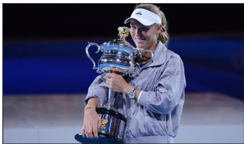
Caroline Wozniacki won the Australian Open in 2018

LONDON (Dispatches) - Former world number one Caroline Wozniacki has announced she will retire after the Australian Open in January.