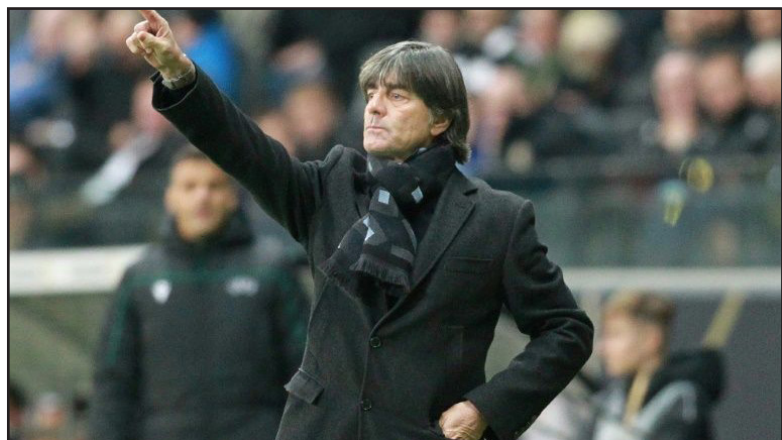
Germany are three-time European champions

"With Spain and Italy, we will face two exceptional teams in the run-up to the tournament, which will be highly valuable,"