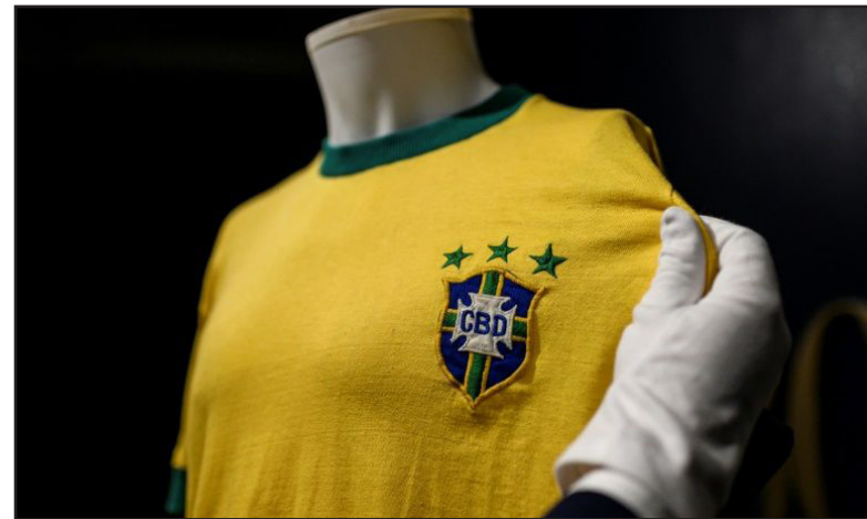
The last Brazil jersey won by football legend Pele sold at the Bolaffi auction house in Turin

MILAN (AFP) - The jersey worn by Brazilian football legend Pele during his final match for the five-time world champions has sold for 30,000 euros ($33,000) in an auction in Italy.