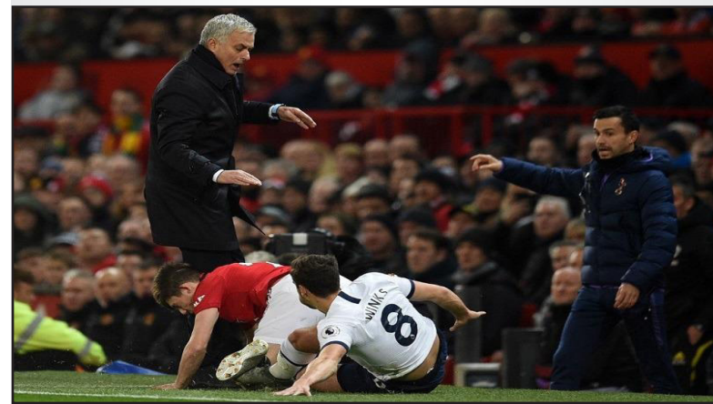
Manchester United's Welsh midfielder Daniel James (2nd L) collides with Tottenham Hotspur's Portuguese head coach Jose Mourinho (L) on the touchline after a challenge with Tottenham Hotspur's English midfielder Harry Winks (R) during the English Premier League football match between Manchester United and Tottenham Hotspur at Old Trafford in Manchester, north west England, on Dec 4, 2019.

MANCHESTER (Dispatches) - Former Manchester United manager José Mourinho's homecoming at Old Trafford was spoiled when the Red Devils triumphed over his new side Tottenham Hotspur.