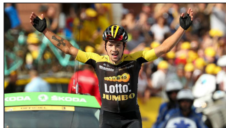
Nairo Quintana believes Primoz Roglic is the primary candidate to triumph at the Vuelta a Espana, which starts on Saturday.

"[Jumbo-Vista] will be at the top of the table from the beginning after the team time trial