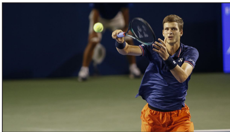
Hubert Hurkacz, of Poland, hits at the net against Denis Shapovalov, of Canada, in the semifinals of the Winston-Salem Open tennis tournament in Winston-Salem, N.C., Friday, Aug. 23, 2019.

Paire, a Frenchman ranked 30th in the world, will try to win his third tournament of the year after claiming titles in Morocco and Lyon, France, in the spring. He