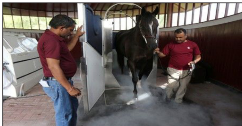
Dubai stables gives prize racehorses cryotherapy