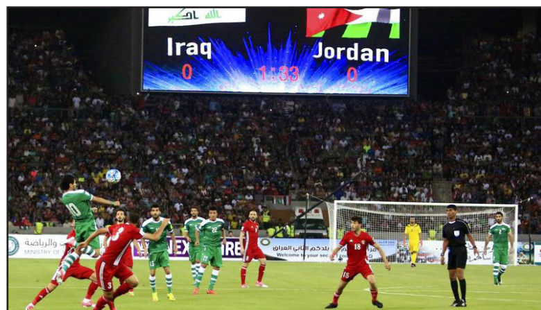
In this June 1, 2017 file photo, Iraq, in green, in action against Jordan, in red, during their friendly football match in Basra, southeast of Baghdad, Iraq.

FIFA says “following a security assessment by a FIFA dele-