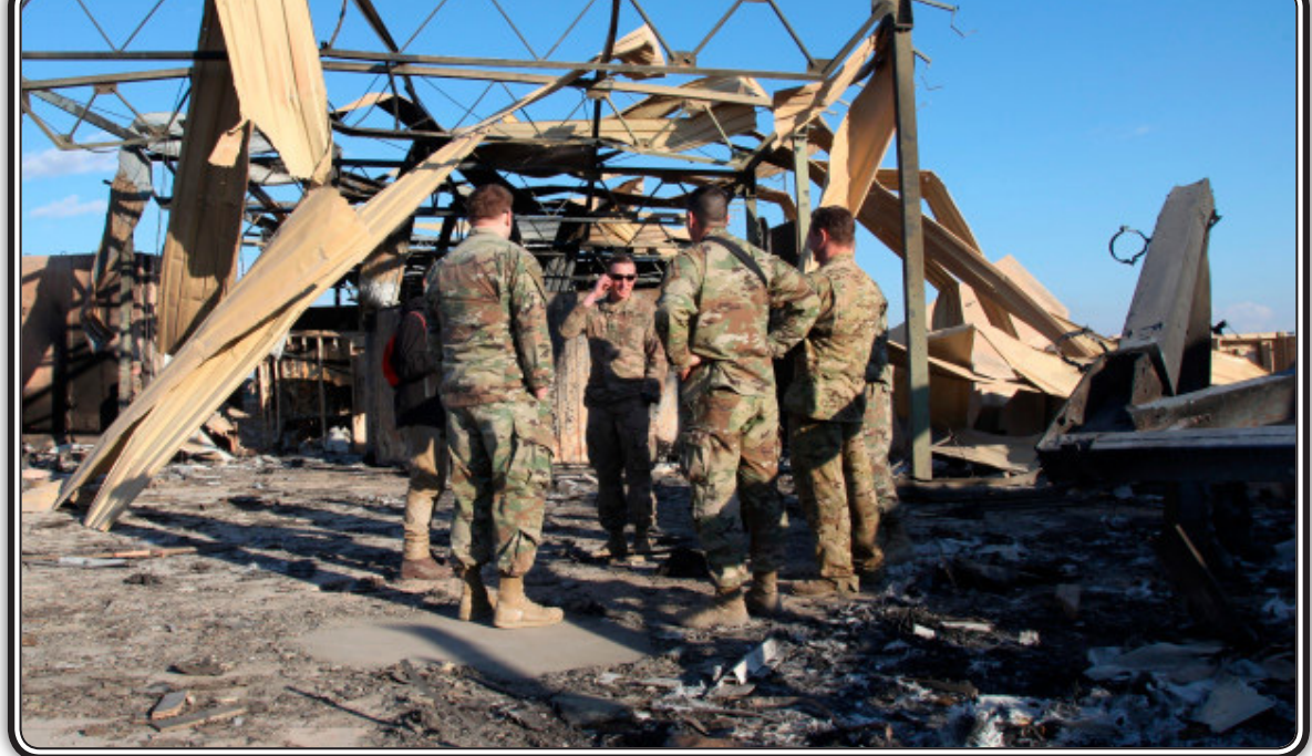
U.S. soldiers stand at the spot hit by Iranian missiles at Ain al-Asad air base, Iraq.

The government in Damascus, which has every right to reclaim its terrorist-occupied territories, has now mounted a determined attack to drive out these murderous agents of the criminal U.S., but unfortunately, in the process some Turkish soldiers, caught in a crossfire, were killed and injured. Diplomacy could have defused the tension-charged situation, but it seems, Ankara instead of heeding the calls from well-wishers to withdraw its forces now that the Syrian forces are rightfully reclaiming their occupied territories, provided some sort of support to the terrorists to kill and injure Syrian soldiers.