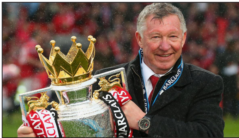
Former Manchester United manager Sir Alex Ferguson was left fighting for his life following emergency surgery for a brain haemorrhage on Saturday.

He was at Old Trafford last Sunday when he presented Arsenal boss Arsene Wenger with a commemorative trophy.