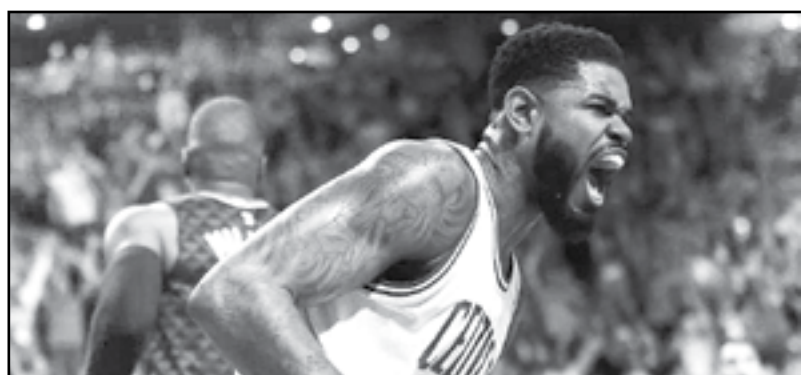
Amir Johnson gets 1 year, $11m deal with 76ers

PHILADELPHIA (AP) — The Philadelphia 76ers have added a second veteran during the opening day of free agency, agreeing to a one-year, $11 million contract with forward Amir Johnson.