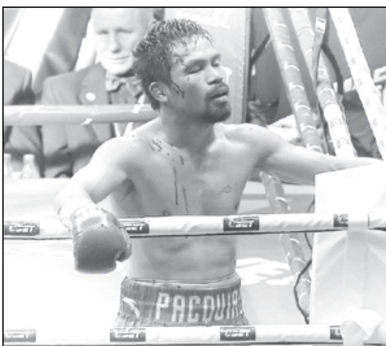
Manny Pacquiao of the Philippines waves to his supporters after his loss to Jeff Horn of Australia, during their WBO World Welterweight title fight in Brisbane, Australia, Sunday, July 2, 2017.