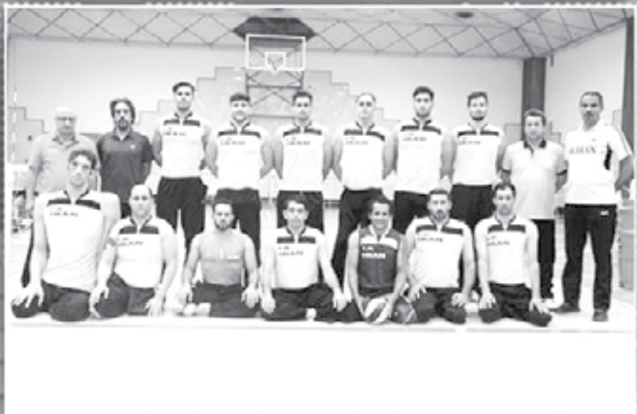
The national Iranian men's sitting volleyball team

TEHRAN (Press TV) - The national Iranian men's sitting volleyball team has captured