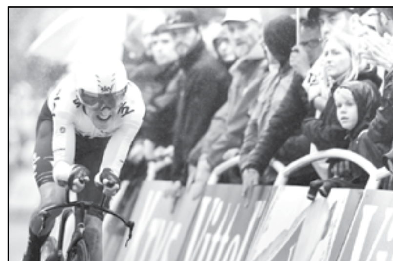
Geraint Thomas won the opening stage of the Tour de France during a rain-drenched individual time trial in Düsseldorf, Germany.

DÜSSELDORF, Germany (Dispatches) — Chris Froome's most loyal support rider finally got some glory of his own.