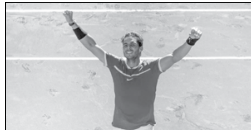
Rafael Nadal of Spain celebrates after the men's singles semifinal match against Novak Djokovic of Serbia at the Mutua Madrid Open in Madrid, Spain, May 13, 2017.

MADRID (Xinhua) -- Spanish number one Rafael Nadal has qualified for the final of the Mutua Madrid Open after defeating number two seed, Novak Djokovic, 6-2, 6-4 in their semifinal.