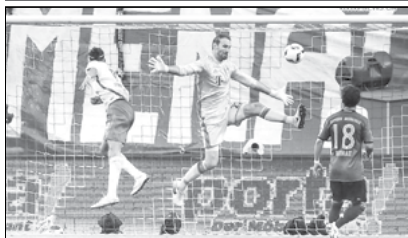
Bayern Munich's goalkeeper Tom Starke (C) blocks a header from RB Leipzig's Yussuf Poulsen (L) during a German Bundesliga match in Leipzig, Germany, May 13, 2017.

BERLIN (Dispatches) - Bayern bounced back and shocked Leipzig with a 5-4 victory on the road while Hoffenheim cruised 5-3 past Werder Bremen at the 33rd round in Bundesliga. Front-runners Bayern Munich turned