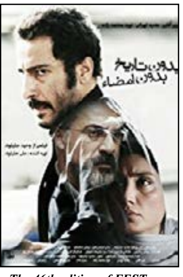
The 46th edition of FEST was held from Feb 23 to March 4.

According to the statement of the jury, 'No Date, No Sign' has questioned such concepts as sin,