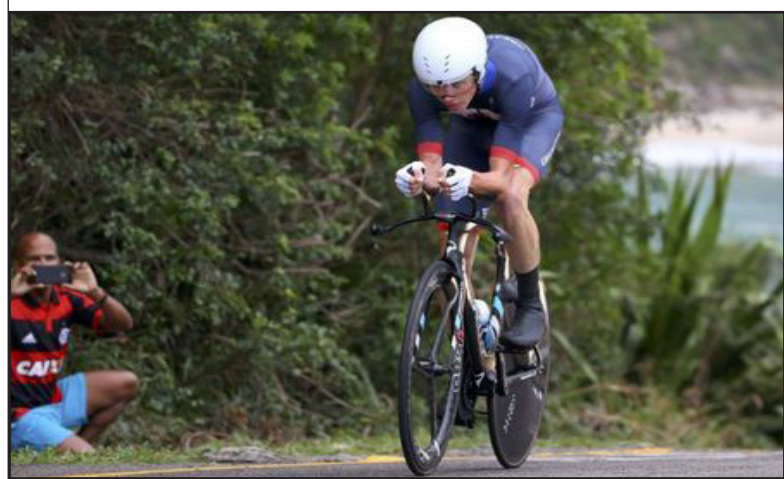
2016 Rio Olympics - Cycling Road - Final - Men's Individual Time Trial - Pontal - Rio de Janeiro, Brazil - 10/08/2016. Chris Froome (GBR) of United Kingdom competes.

LONDON (Reuters) - Chris Froome will start his 2018 season as favorite for Spain's Ruta del Sol on Wednesday, defying calls from senior figures in world cycling to withdraw from racing over the adverse drug test result he returned last September.