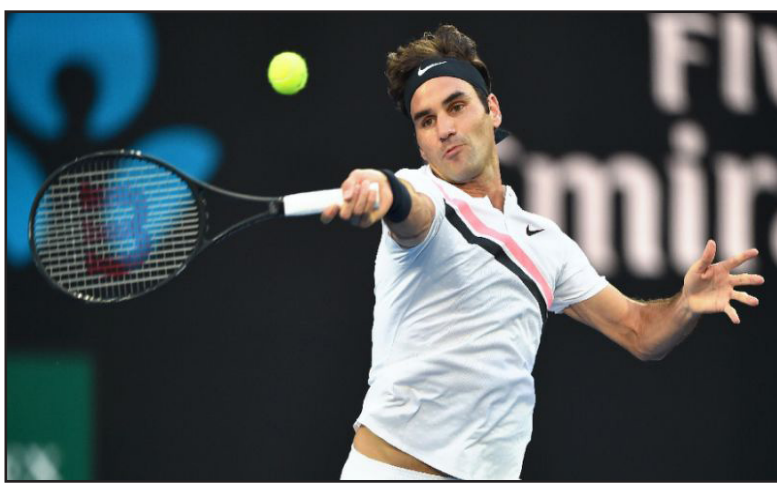
Roger Federer is dreaming of returning to number one at the age of 36 -- to do so he must reach at least the semi-finals at the Rotterdam tournament

"I would love to be in that position with anyone, but with Stan it would be like a Grand Slam final, a big-time match," said Federer, fresh from winning a 20th Grand Slam title at the Australian Open.