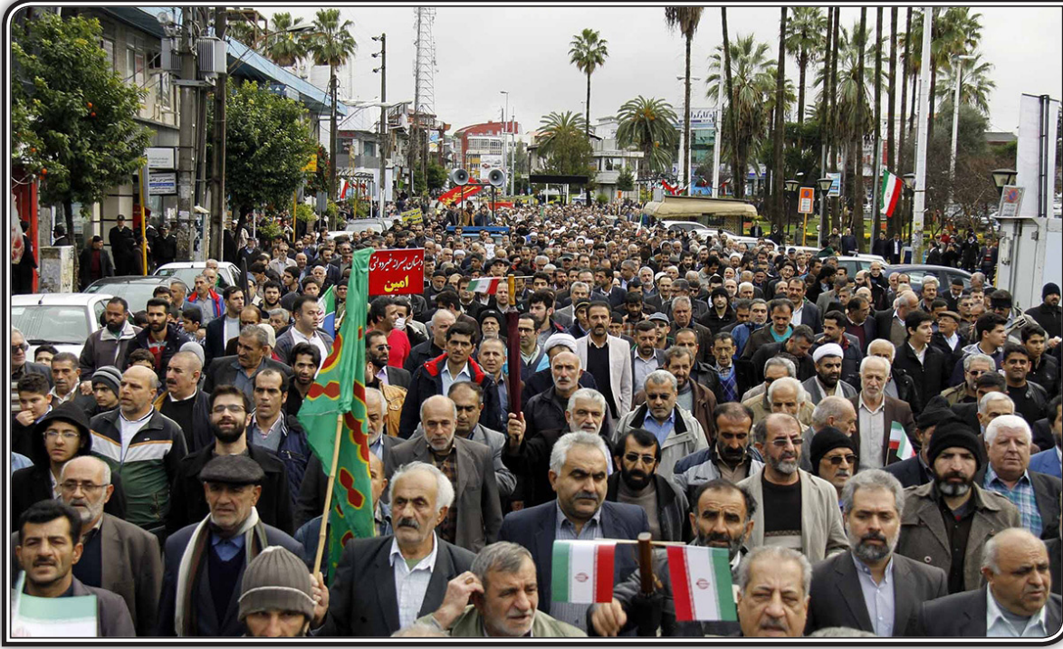
Demonstrators march in a show of unity and strength to condemn scattered riots in a number of Iranian cities on January 3, 2018.

TEHRAN (Dispatches)—Chief commander of the Islamic Revolution Guards Corps (IRGC) announced the "end of the sedition" Wednesday as millions of people rallied across Iran in a massive show of unity and strength after days of deadly riots which were vociferously supported by the country's sworn enemies. General Muhammad Ali Jafari said the IRGC only intervened "in a limited way" against fewer than 15,000 "trouble-makers"