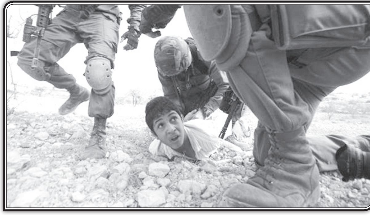
This file photo shows a Palestinian teenage boy being arrested by Zionist troops for throwing stones during a protest in the occupied West Bank.

WEST BANK (Dispatches) -Palestinian minors in the Zionist regime's jails say they have been subjected to different types of torture, including physical and psychological abuse, by Zionist officials during detention and interrogation, a rights body reports.