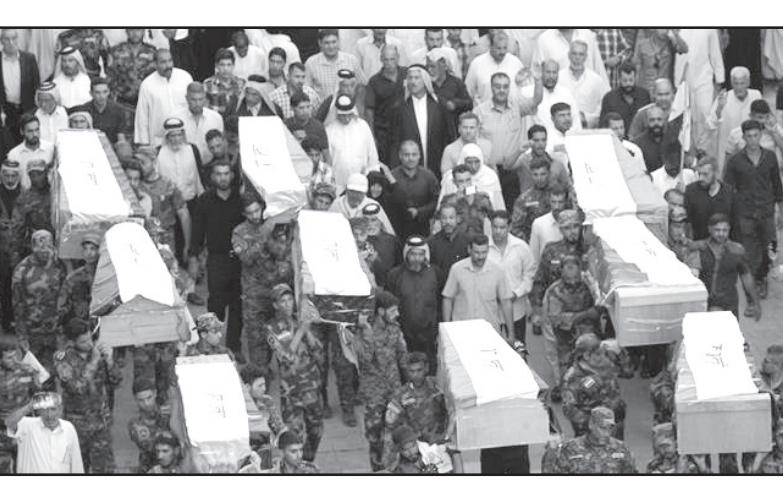
Iraqi soldiers carry coffins containing the remains of their comrades who were killed in the Speicher massacre, after they were handed over to relatives following weeks of examination to check their identities via DNA tests, during their funeral procession in the holy Iraqi city of Najaf on July 1, 2015.

has executed three dozen men convicted of involvement in the massacre of hundreds of military recruits in the central city of Tikrit in June 2014.