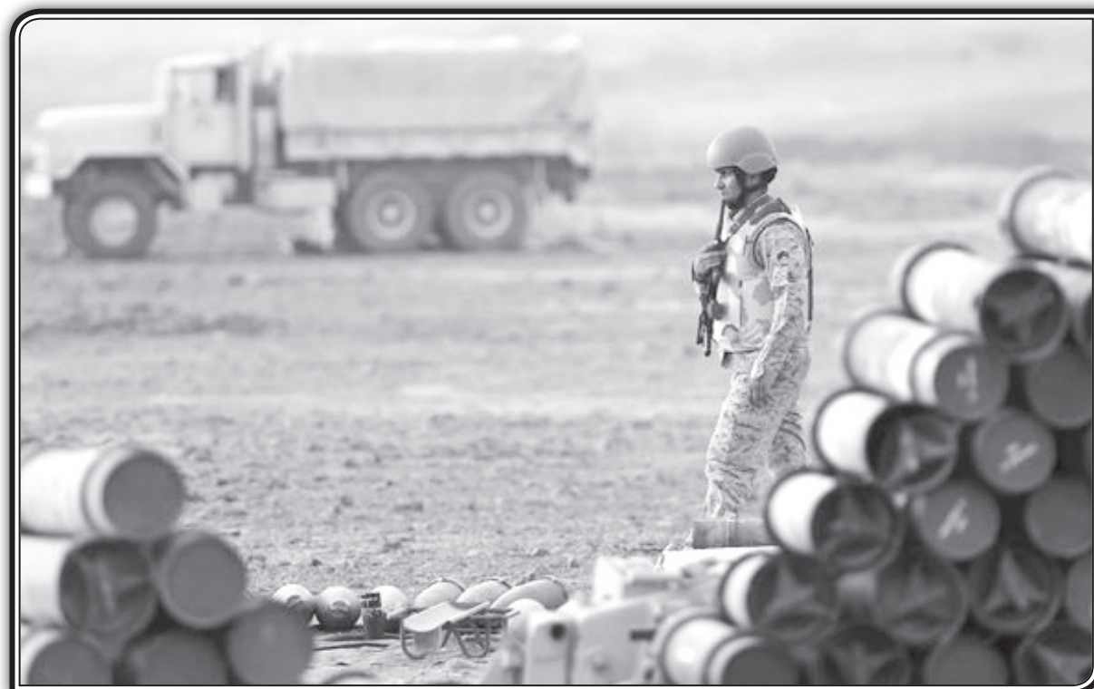
A Saudi soldier from an artillery unit walks near ammunition at a position close to the Saudi-Yemeni border, in the kingdom's southwestern Jizan Province.

SANAA (Press TV) – Yemeni forces have killed scores of Saudi mercenaries in the war-hit country's northern province of al-Jawf, local reports say.