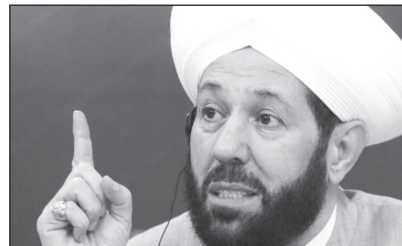
Syria's Grand Mufti Sheikh Ahmad Badreddin Hassoun

DAMASCUS (Dispatches) – Syria's Grand Mufti Sheikh Ahmad Badreddin Hassoun says Damascus has been repeatedly offered a deal according to which the terrorists would cease their hostilities against the government if it made concessions to the Zionist regime.