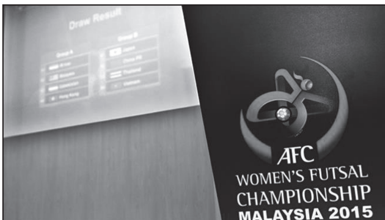
The 2015 AFC Women's Futsal Championship will be held in Kuala Lumpur, Malaysia,

Football Confederation (AFC) Women's Futsal Championship scheduled to be staged in late September.