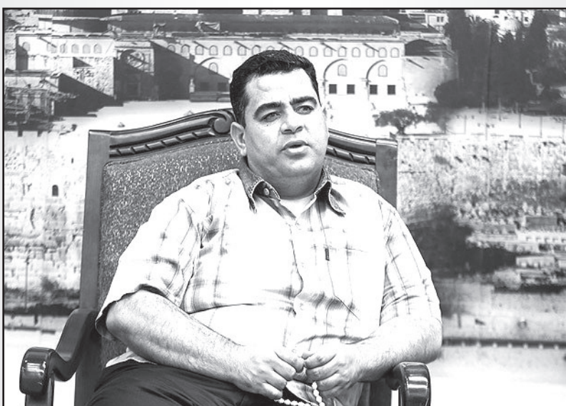
Turkish Cooperation and Coordination Agency (TIKA) plans to build 20,000-seat stadium in Gaza Strip

Haniyeh said, earlier on Sunday, that TIKA held an iftar (breaking