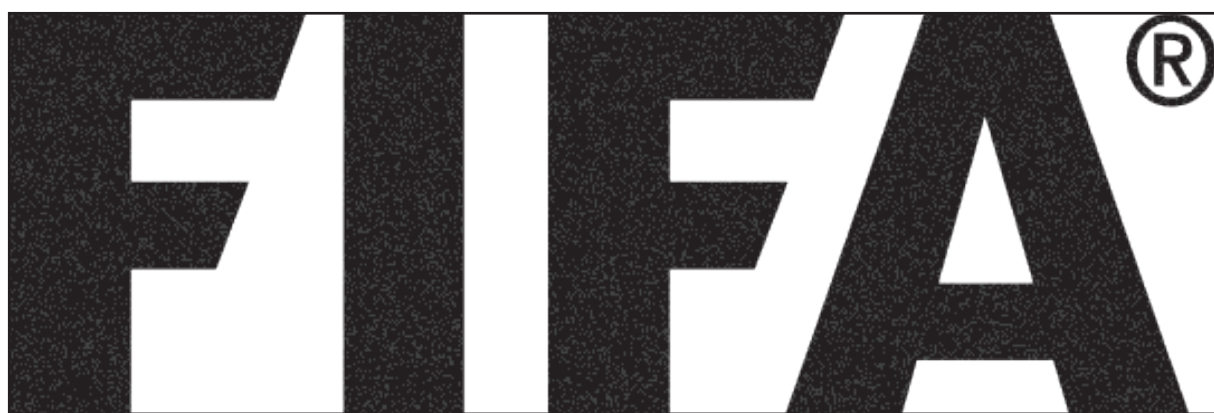
Logo of FIFA