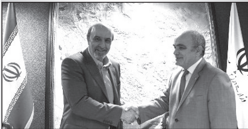
Russian envoy calls for Iran support in 2018 World Cup

TEHRAN (IRNA) - Minister of Sports and Youth Mahmoud Goudarzi said Monday that following signing an MoU with Russia on sports cooperation, Iran will officially announce its support for Russia's hosting of World Cup 2018.