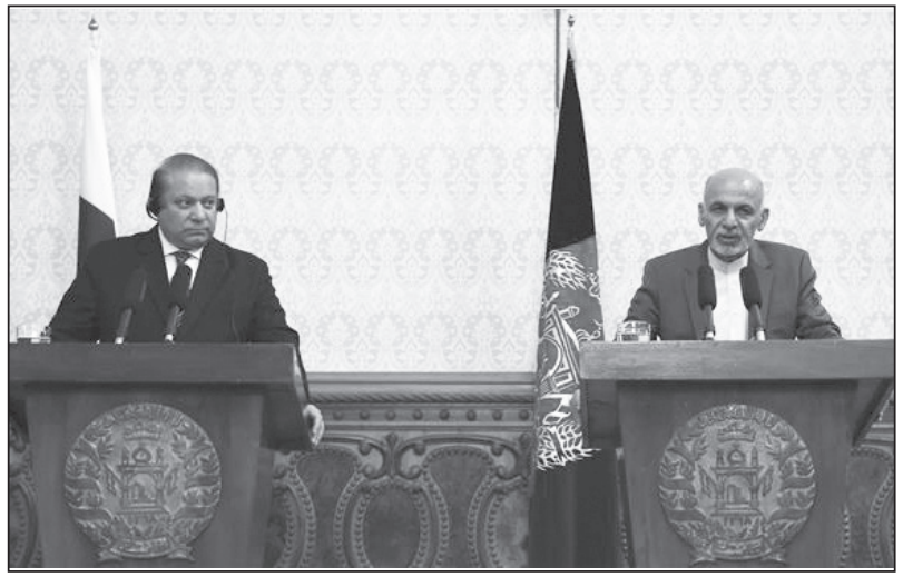
Afghan President Ashraf Ghani (R) speaks during a press conference while Pakistani Prime Minister Nawaz Sharif looks on at the Presidential palace in Kabul.

KABUL (Press TV) – Afghan President Ashraf Ghani has demanded tough action from Pakistan against Taliban militants amid deteriorating security situation along the Afghan-Pakistan border. In a letter seeking greater anti-