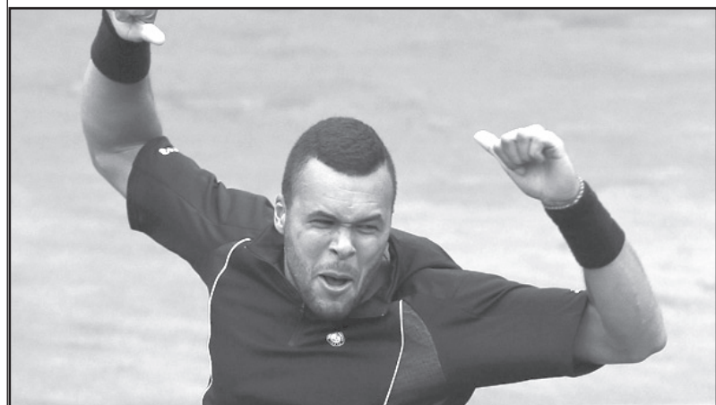
Jo-Wilfried Tsonga of France celebrates after beating Tomas Berdych of the Czech Republic during their men's singles match at the French Open tennis tournament at the Roland Garros stadium in Paris, France

PARIS (China Daily) - Frenchman Jo-Wilfried Tsonga dismissed Czech star Tomas Berdych to delight the local spectators who came to Roland Garros and just found all play halted for more than two hours by rain on Sunday.