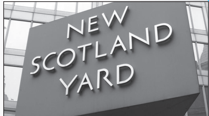
Scotland Yard calls for public vigilance as security is reviewed for sporting event and anniversaries of Gallipoli campaign and Anzac Day.

ing British militants travelling to Iraq and Syria to learn terrorist “tradecraft”. Fears of a terrorist attack on Britain’s streets heightened in the wake of the rise of ISIL, the extremist group that has taken over large swaths of Iraq and Syria and attracted thousands