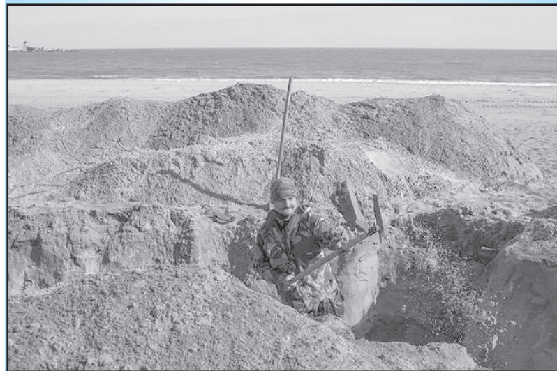
A Ukrainian serviceman digs trenches on a beach in the port city of Mariupol on the Azov Sea, March 20, 2015.

the rebels. Large quantities of heavy weapons with a caliber of more than 100 mm have been withdrawn by both sides under the Minsk agreements, brokered by the leaders of Ukraine, Russia, Germany and France in Belarus in February. Both sides accuse the other of