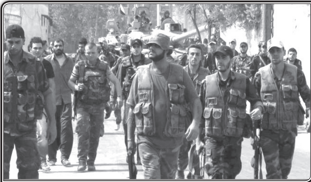
Syrian armed forces score major advances against the foreign-backed terrorists across the country.

DAMASCUS (Dispatches) – Syrian army forces have continued carrying out military operations against the foreign-backed terrorists across the country, inflicting major losses and casualties on the terrorists.