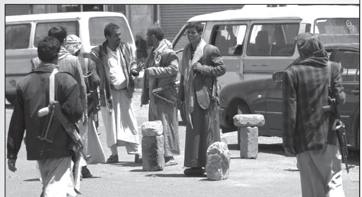
Clashes continue between Ansarullah fighters and Salafist Islah party loyalists in the Yemeni capital.

The Salafists are backed by some army units, which are under the control of Ali Mohsen al-Ahmar,