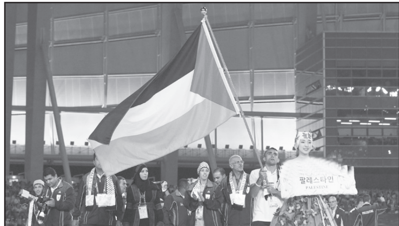
The Palestine contingent in the Games’ opening ceremony at Incheon

INCHEON (Indian Express) – The head of the Palestinian Olympic Committee said that the “battle” to get to the Asian Games just weeks after a brutal 50-day war in Gaza.