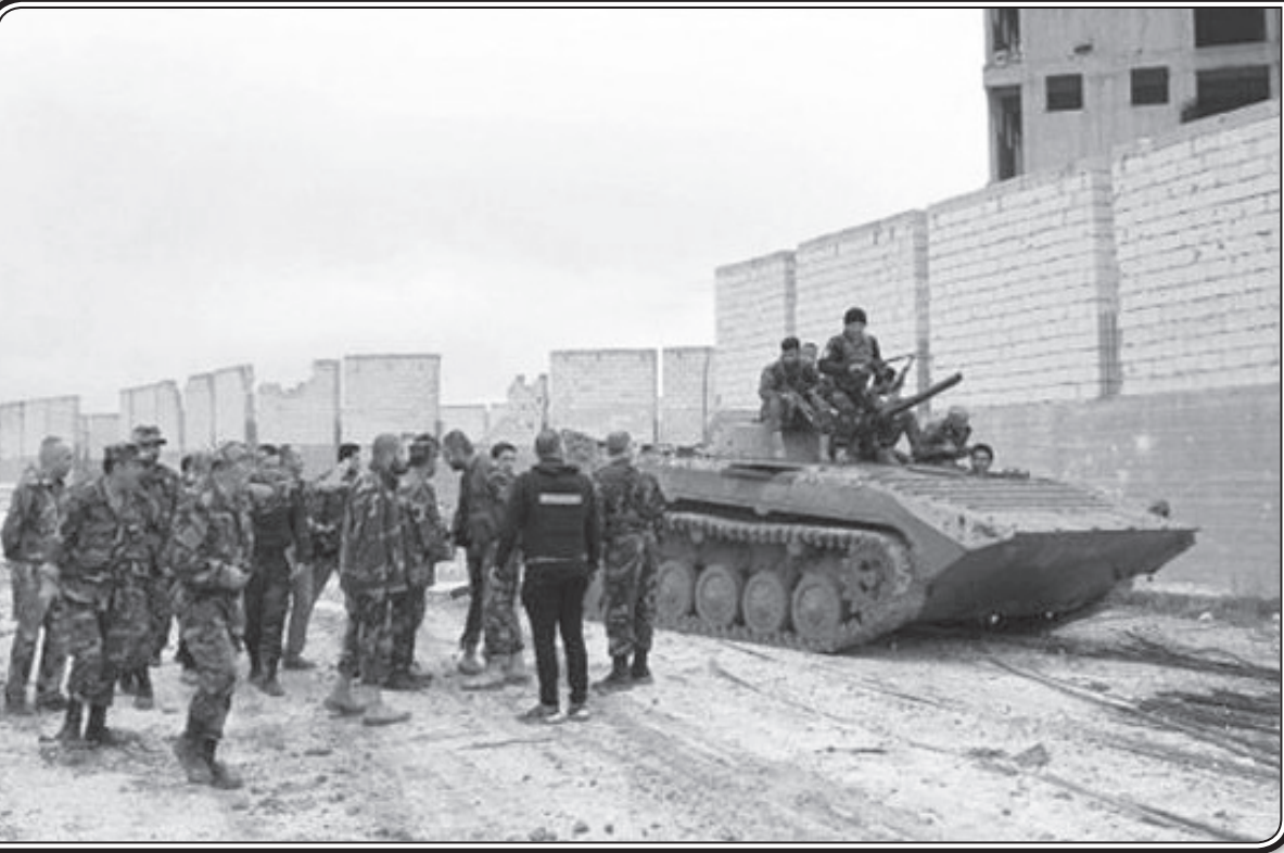
Syrian army forces on a road near the town of Al-Jbaileh on the outskirts of Aleppo, northwest Syria