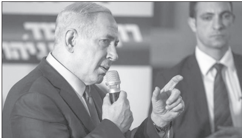
Zionist Prime Minister Benjamin Netanyahu delivers a speech to his supporters during an election campaign meeting in the Mediterranean coastal city of Netanya.

occupying regime’s ambassador to Stockholm Isaac Bachman was recalled. Netanyahu’s comments come just two days before Israel’s parliamentary election as his Likud Party is facing a tough challenge against competitors. An opinion survey on March 10 revealed that the opposition Zionist Union is edging Netanyahu’s right-wing Likud party in the March 17 elections. The poll conducted by Israeli research institute, Panel Politics, found that Isaac Herzog’s Zionist Union, which identifies itself as center-leftist, could earn 24 seats against Likud’s 21 projected seats in the Knesset (the Zionist regime’s parliament). Earlier on Thursday, Netanyahu acknowledged that his Likud party