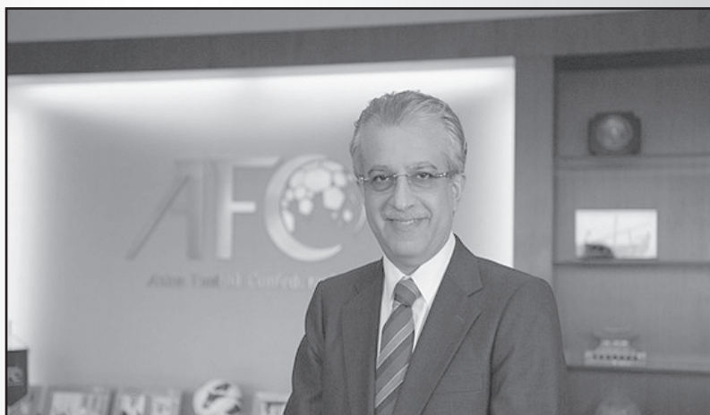
Shaikh Salman bin Ebrahim Al Khalifa

Shaikh Salman also noted that the AFC is looking to strengthen