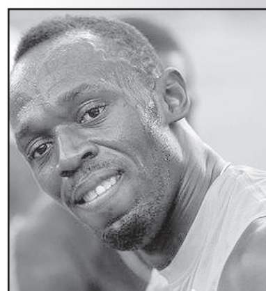
Jamaica's Usain Bolt smiles shortly after crossing the finish line first, in his first race of the season during the Gibson Relays in Kingston

The six-time Olympic gold medalist came off the final curve comfortably ahead of the field and his time was slightly faster than his last effort at the distance, 46.44 seconds in 2013, but more than a second slower