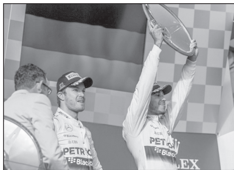
Defending Formula 1 champion Lewis Hamilton wins first Grand Prix of season in Australia