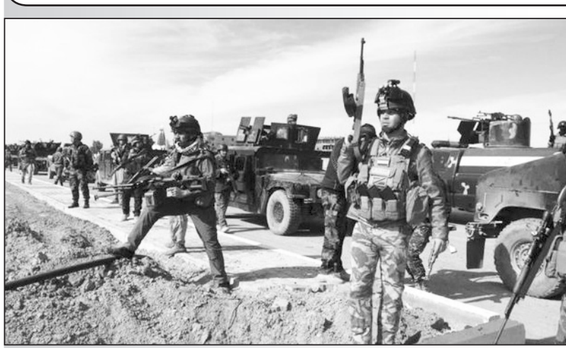
Iraqi army forces in Baiji