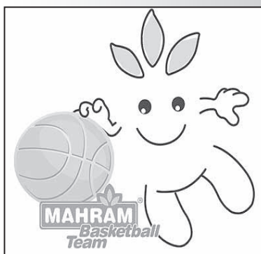
mahram club logo