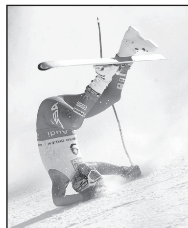
United States' Bode Miller crashes during the men's super-G competition at the alpine skiing world championships, Thursday, Feb. 5, 2015, in Beaver Creek, Colo. Miller did not finish the race.

"It's a great, great day for me. I think the most beautiful of my life."