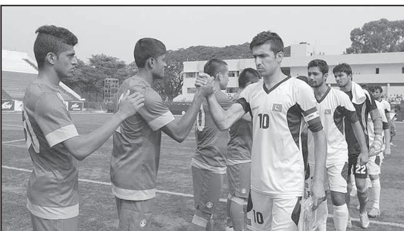
Afghanistan Beats Pakistan in Soccer Friendly

KABUL (FIFA) - Pakistan bagged an injury-time win over neighbors Afghanistan in their football friendly on Friday, earning a measure of revenge for their trouncing two years ago in Kabul.