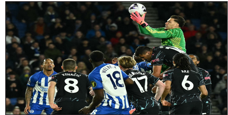
Manchester City's Brazilian goalkeeper #31 Ederson jumps to save from a corner kick during the English Premier League football match between Brighton and Hove Albion and Manchester City at the American Express Community Stadium in Brighton, southern England on April 25, 2024.

BRIGHTON (Reuters) - Phil Foden struck twice as Manchester City stepped up their bid for a fourth Premier League crown in a row with a ruthless 4-0 victory at Brighton & Hove Albion on Thursday.