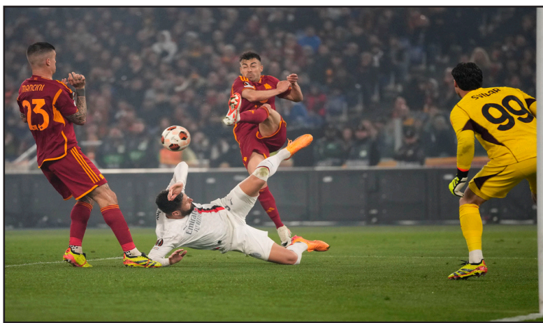
Roma's Stephan El Shaarawy (center) kicks the ball away as AC Milan's Olivier Giroud tries to score during the Europa League quarterfinal second leg soccer match between Roma and AC Milan, at Rome's Olympic Stadium, on April 18, 2024.

Paulo Dybala doubled the advantage for the hosts 10 minutes later with a curled shot inside the far post before Matteo Gabbia pulled one back for Milan five minutes from time, nodding