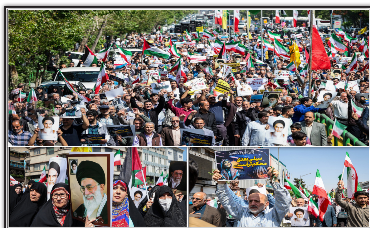
Iranians rally on the streets of Tehran after Friday prayers to support the IRGC's drone and missile strike on the occupying regime of Israel.