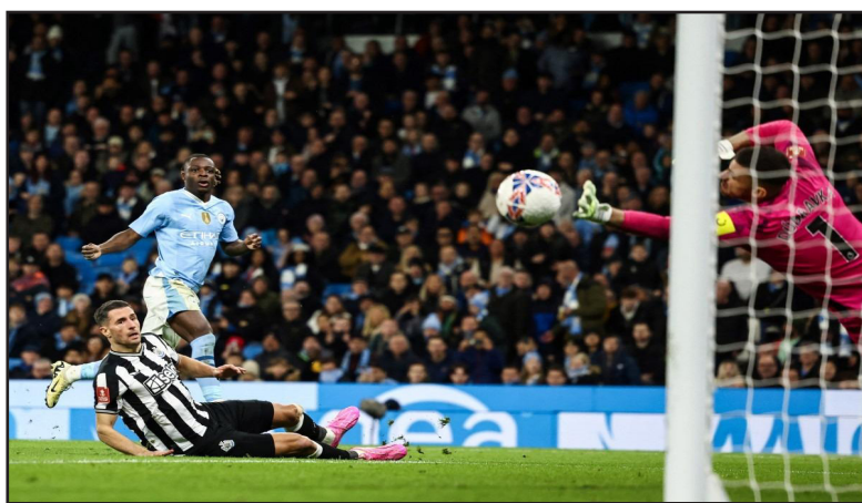
Manchester City's Belgian midfielder #11 Jeremy Doku has a shot saved by Newcastle United's Slovakian goalkeeper #01 Martin Dubravka

back in the 36th minute but Stefan Ortega got down brilliantly to his left to keep the Swedish striker's bouncing shot out. It proved to be Newcastle's only effort on goal in the game.