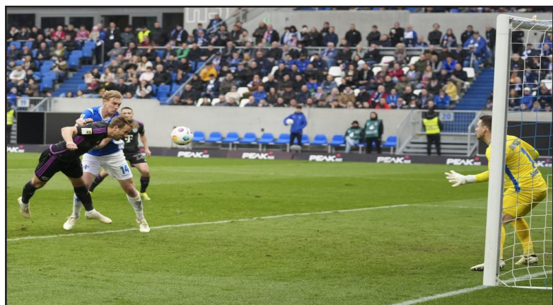
Bayern's Harry Kane (left) scores his side's second goal during a German Bundesliga soccer match between SV Darmstadt 98 and Bayern Munich in Darmstadt, Germany, on March 16, 2024.

But he was taken off injured in the 81st after sliding into the post, getting tangled in the sidenetting