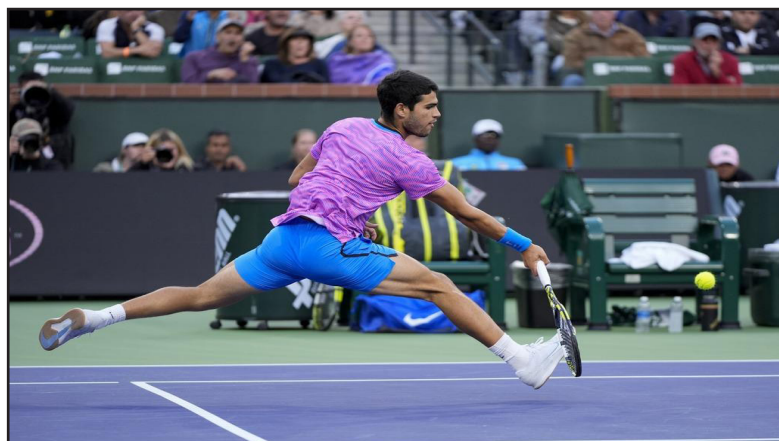
Carlos Alcaraz, of Spain, returns to Jannik Sinner, of Italy, during a semifinal match at the BNP Paribas Open tennis tournament, on March 16, 2024, in Indian Wells, California.

CALIFORNIA (Reuters) - Defending champion Carlos Alcaraz came from behind to beat Jannik Sinner 1-6 6-3 6-2 to reach the Indian Wells final and end the Italian's winning streak this sea-