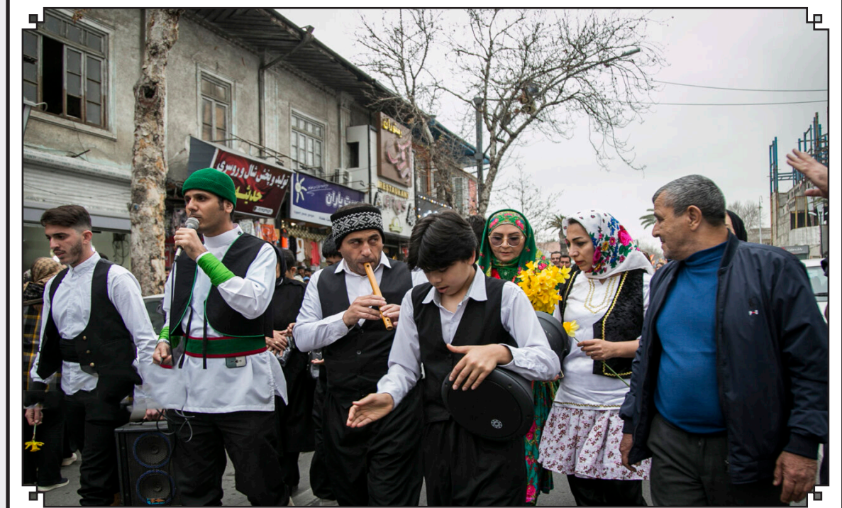
Nowruz Khani or singing for Nowruz is a tradition in which people in northern Iran, including Golestan province, go at the door of their neighbors and sing songs about the impending coming of the spring.